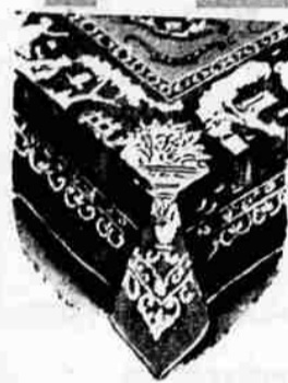
TABLE CLOTHS AT A SPECIAL LOW PRICE!

Plastic covers help cut down on laundry bills! A whisk of a damp cloth, and they're clean! Choose bright, splashy prints on a clear ground! Buy several at this terrific special price; 54"x54"