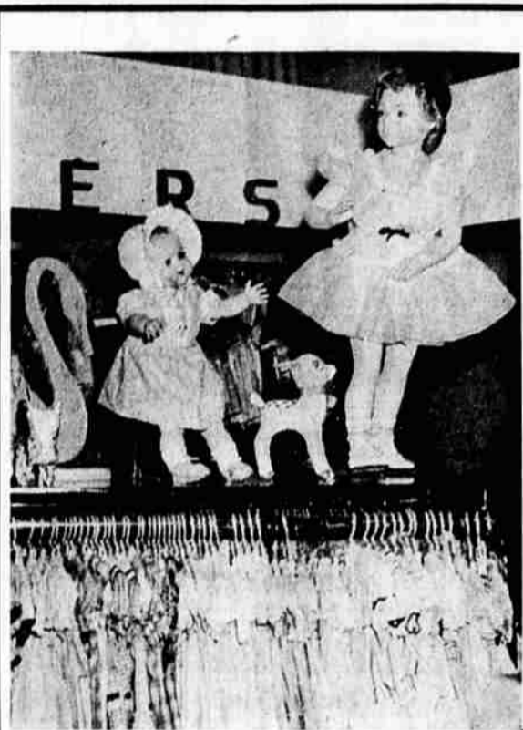
One of the Treats in Store for YOU. Take the elevator to the second floor.