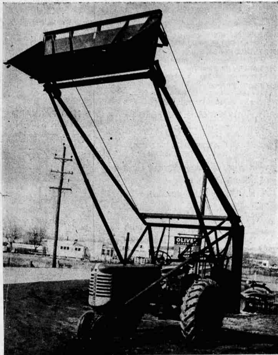
FARM HAND HYDRAULIC loader displayed at Garrison Equipment Co., near the Big Y, can stack hay up to 27 feet high. It's mounted on an Oliver 66 Row Crop tractor. This particular scoop is for chopped hay or snow.

ing accommodations can be arranged. The conference will include farm men and women and business men.