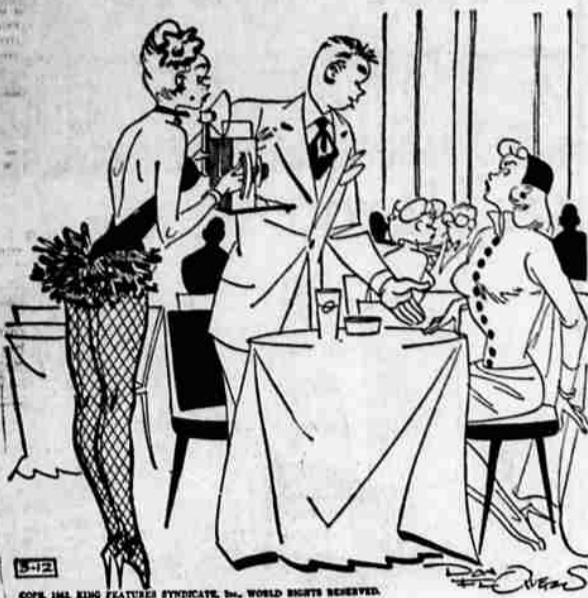
"Now you take one of US together."