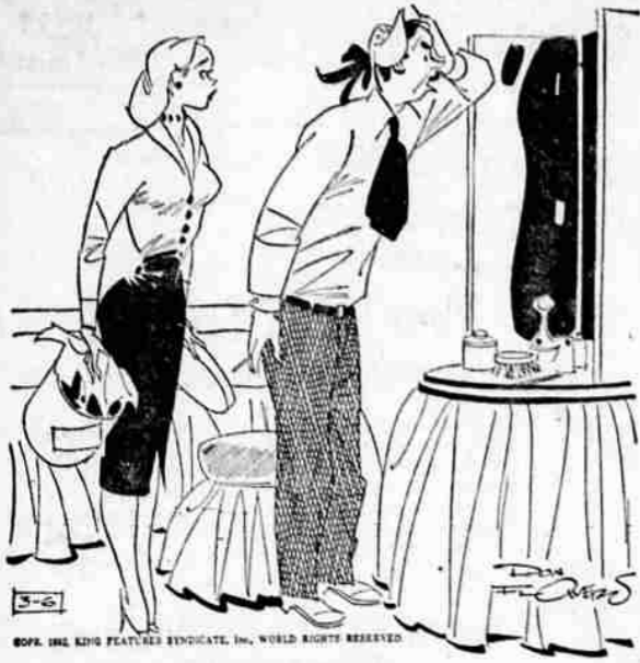
"Nope... I don't even like it on ME."