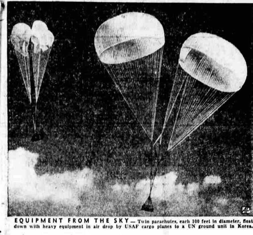
EQUIPMENT FROM THE SKY — Twin parachutes, each 100 feet in diameter, float down with heavy equipment in air drop by USAF cargo planes to a UN ground unit in Korea.