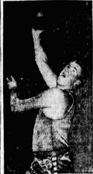
CLYDE LOVELLETTE ... two-timer

BETHANY, W. Va., (AP)—It probably will be another 40 years before athletic teams from Bethany College and its five-mile distant neighbor, West Liberty State, play each other again.