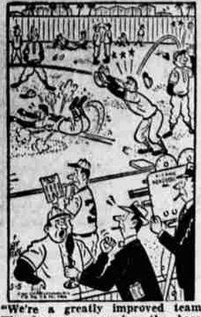
"We're a greatly improved team! The boys are running the bases ragged, hitting long balls and showing a lot of hustle!"