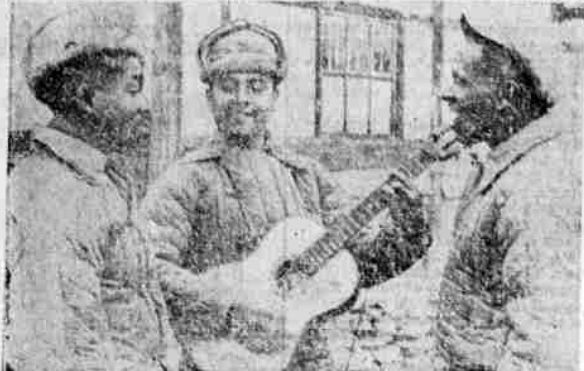
IN RED PRISON CAMPS — Three United Nations soldiers held prisoner by the Reds in North Korea camp, seem to be enjoying a chess game (top). In lower photo two GI's sing as a third strums a guitar. The Communist who gave the photos to United Nations newsmen at Panmunjom did not identify the prisoners of war.