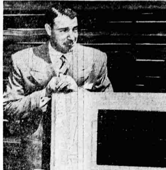
HE'S IN THIS LINEUP—Although Joe DiMaggio, ex-New York Yankee centerfielder, is not in the regular lineup this season, he is on the one in this plaque in Los Angeles dedicated to baseball's "Greatest Lineup."

MELBOURNE, Australia (AP)—A motorist nearly ran over a young platypus 40 miles from Melbourne.