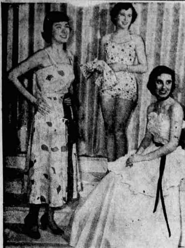
GLAD RAGS FROM FEED BAGS—Before the National Association of Soil District convention at Cleveland, three Baldwin-Wallace College students model clothing made from feed bags.