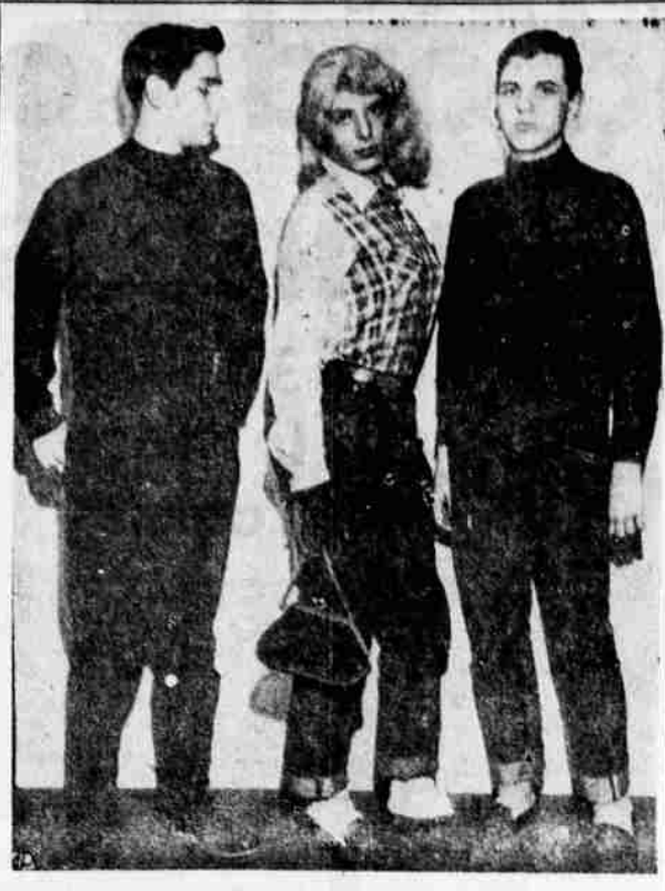
BOY OR GIRL?—Despite all the platinum hair, etc., the one in middle is a boy. Police arrested trio as they hitchhiked through Memphis, Tenn., enroute to New Orleans.