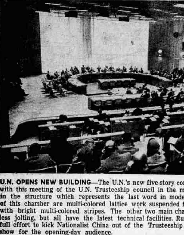
U.N. OPENS NEW BUILDING—The U.N.'s new five-story conference building was opened with this meeting of the U.N. Trusteeship Council in the most unorthodox of all rooms in the structure which represents the last word in modernity.