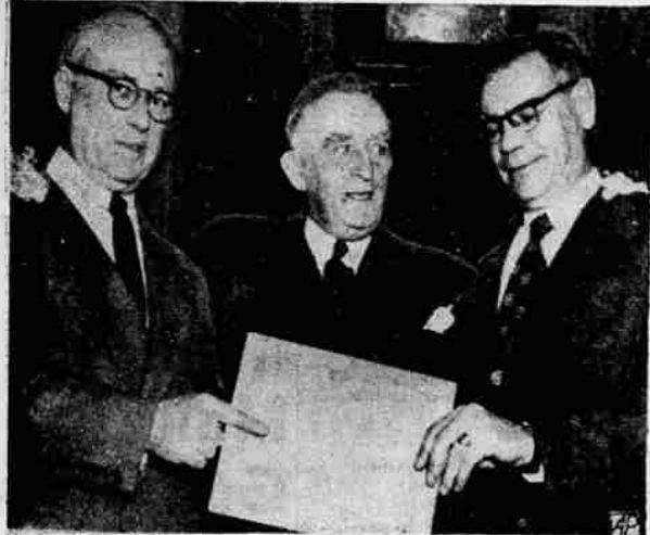
VOYAGE AGAINST THEM—Delegate Joseph R. Farington (R-Hawaii), Sen. Joseph O'Mahoney (D-Wyo) and Delegate E. L. Bartlett (D-Alaska) pose at the capitol in Washington, where the senate by a one-vote margin sent the Alaska statehood bill back to committee for further study.