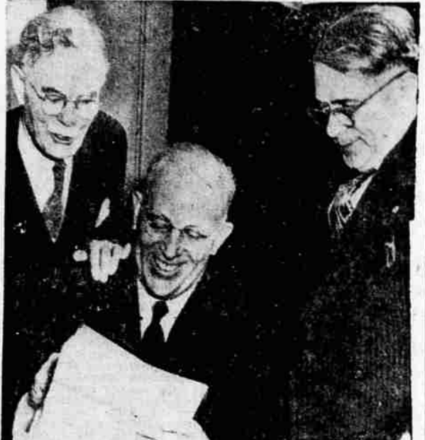
WARREN IN RACE — Gov. Earl Warren of California, officially entered Wisconsin's Republican presidential delegate election when he signed his consent for the April 1 race.