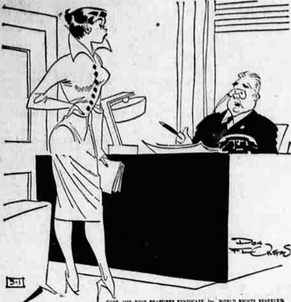
"Another raise?! Isn't it your husband's turn to ask HIS boss for one?!"