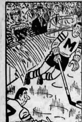
"Maybe next time you'll know better than to wear a low cut evening dress to a hockey match!"