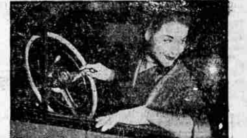
POWER STEERING ...easy as dialing a telephone! You can actually turn the wheel with one finger even when the car is at a standstill.