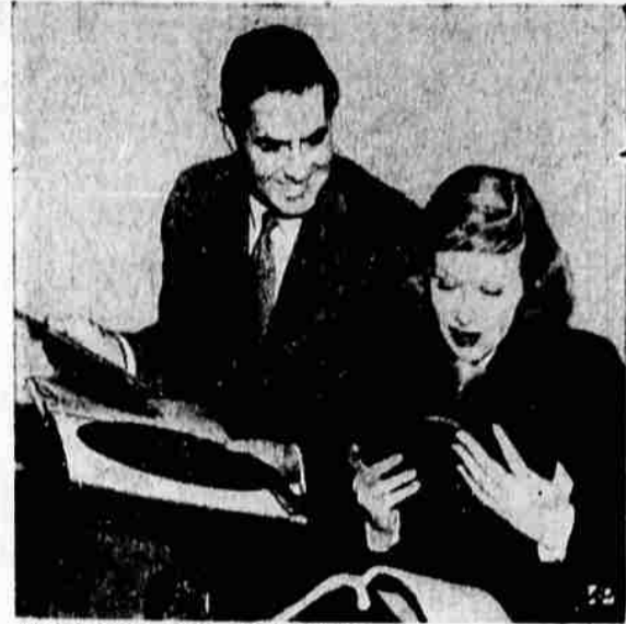
RECORD RELAXATION — Tyrone Power gets acquainted with his new co-star, German-born Hildegarde Neff, as they select records for a concert between takes on Hollywood set.