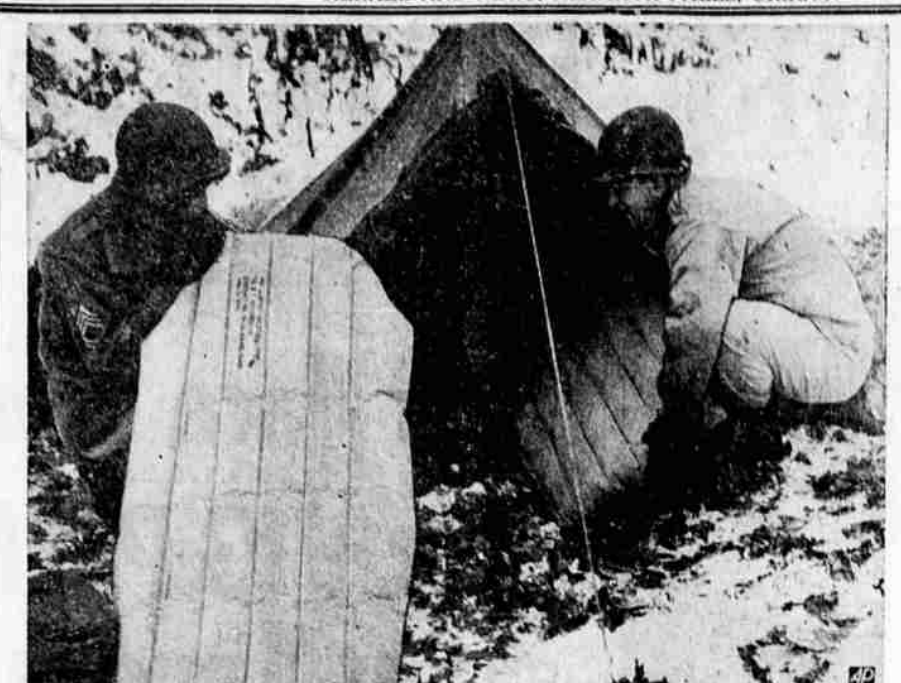
SUPER SACKS-U.S. servicemen in Far East are to be equipped with lightweight inflatable sleeping pads of nylon fabric and rubber, treated to resist cracking in cold weather.

Here In Klamath Want Ads Work Wonders HERALD & NEWS Ph. 8111