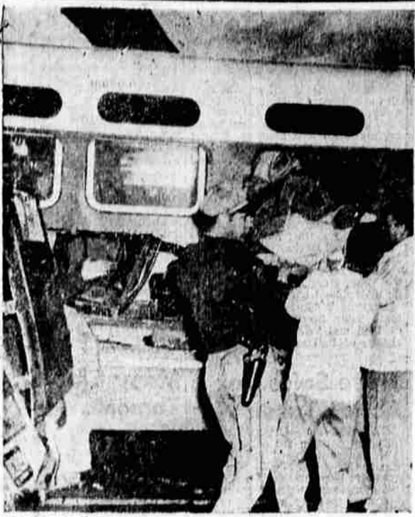
BUS SLICED OPEN — Ambulance stewards, aided by a California Highway Patrol officer, remove one of 10 persons injured when this commuter bus was side-swiped by a big truck and flatbed trailer on the Oakland side of the San Francisco-Oakland Bay Bridge. The two vehicles were ripped open by the truck's flatbed trailer.