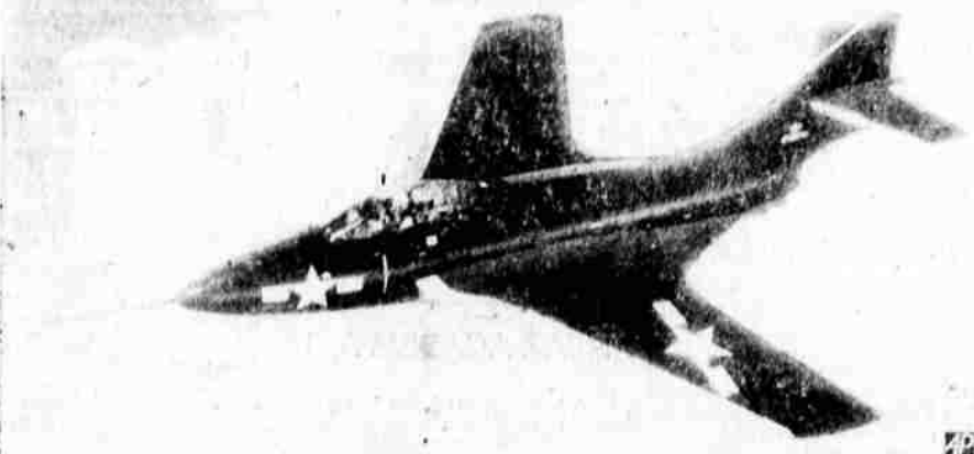
LATEST NAVY 'CAT' — The Gruman F9F-6 Cougar, latest member of the U.S. Navy fighter plane family, knives through the sky in a test flight. The streamlined jet fighter craft, rated for security reasons in the "over 600 miles per hour" class, is a swept-wing successor to the Panther, first jet to be used in combat by the navy.