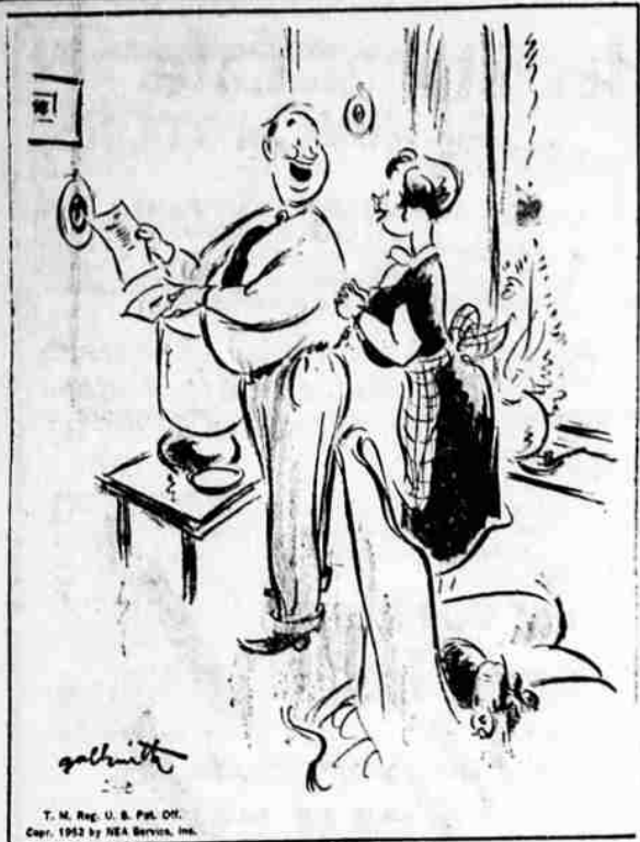
"Two of their boys were drafted—now we know they'll have room if we want to visit them in the spring!"

HERALD AND NEWS, KLAMATH FALLS, OREGON Page Eight Wednesday, February 20, 1952