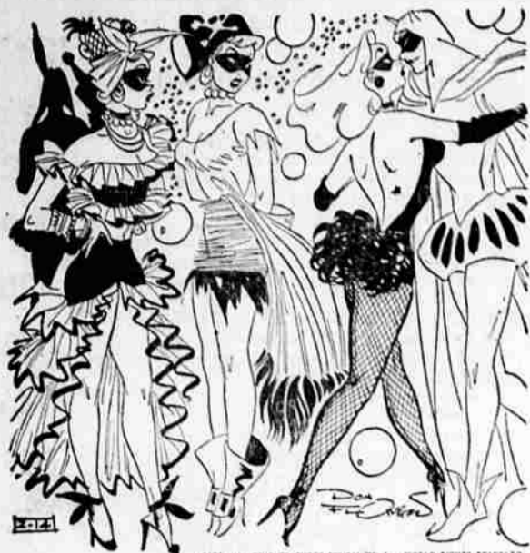
"Whoever she is, she wore that same costume LAST year!"