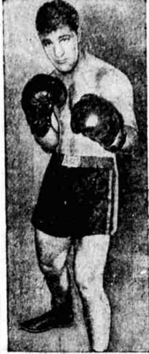
ROCKY MARCIANO ... too many bombs