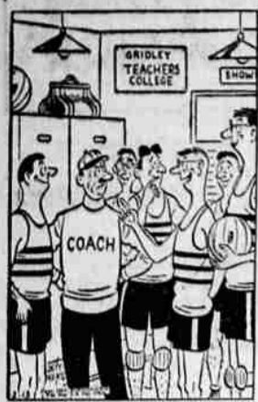
"Very good pep talk, Coach—but you made four rather bad grammatical errors!"