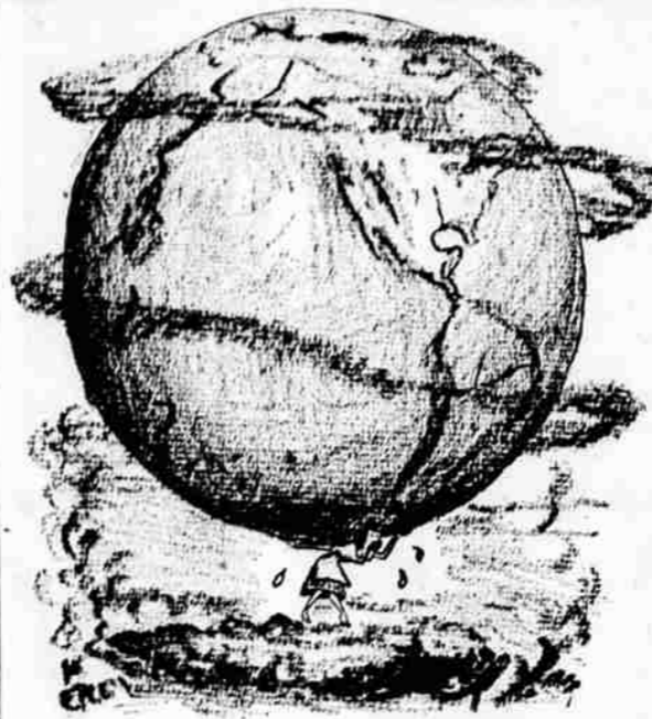
"It's A Woman's World All Right!"