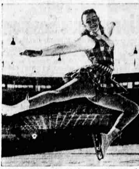
HIGH-FLIERS—Pretty Suzanne Morrow, (left), Canadian champion, and Dick Button, 1951 world's champion from the United States, cut some fancy figures while training at Garmisch, Germany, for the Winter Olympics to be held in Oslo, February 14-25. Button was a gold medal winner in the 1948 Olympics in London.

There are nine bases in the Northwest region and all are expected to send a team. The five states are Oregon, Washington, Montana, Idaho and Utah.