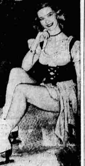
THE GREAT SCOTT —Barbara Ann, that is. The lovely Olympic figure skating champion from Canada poses prettily at the ice show which stars her in New York's Madison Square Garden.

SHUFF STUFF Wocus and Tat's turned in blanks in the city shuffleboard league last night while the Vets beat Summers Lane, 3-1. Wocus shut out Eagles, 4-0; Tat's whitewashed Missoupp.