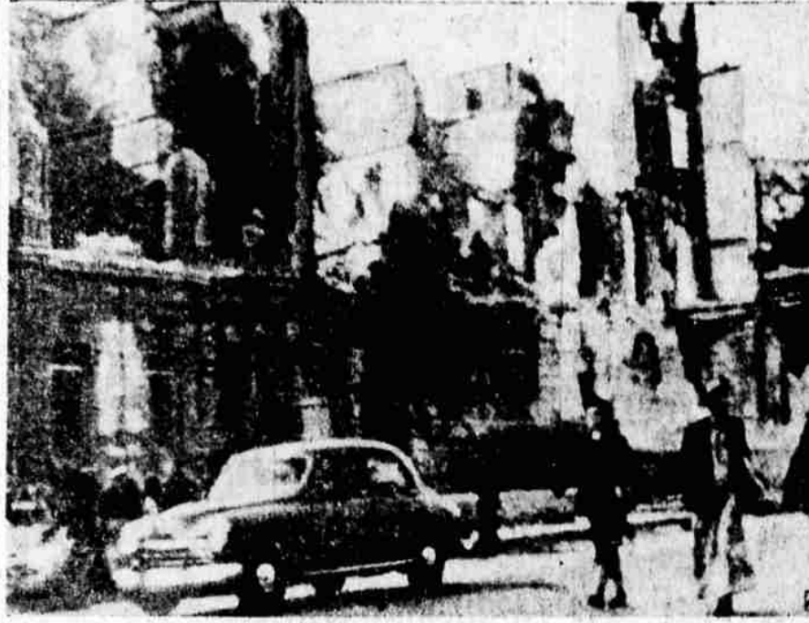
RIOT AFTERMATH IN CAIRO —Sunday sightseers walk past a row of houses burned during the previous day's rioting in Cairo, Egypt. Martial law was declared following the Saturday riots, in which at least 67 persons died. The city was quiet after its third night of military curfew.