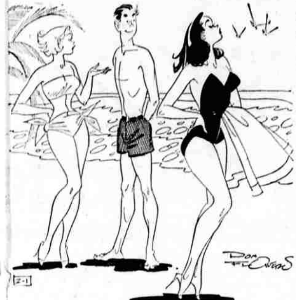
"Yeah, but how would she look in a wedding gown?"