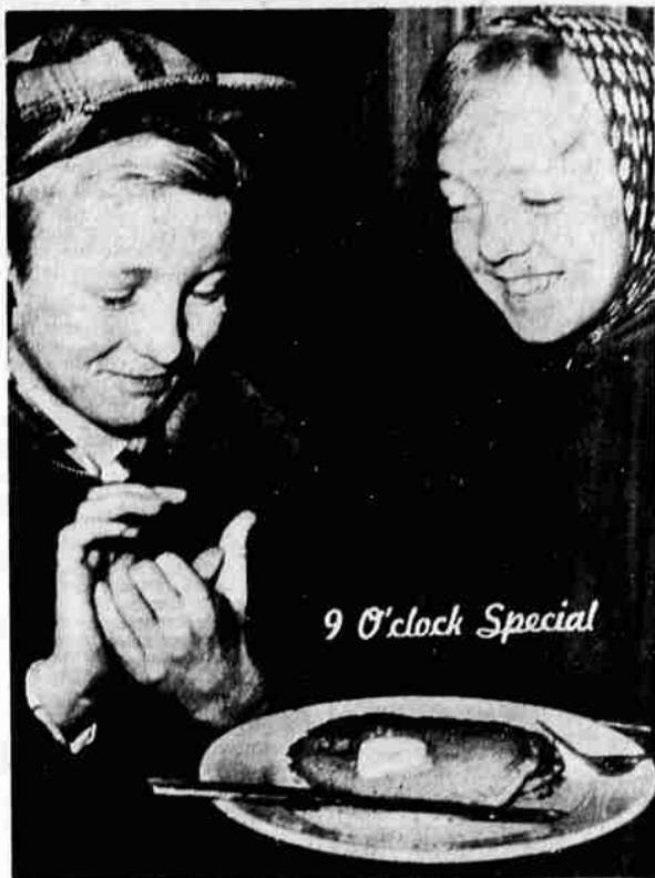
9 O'clock Special