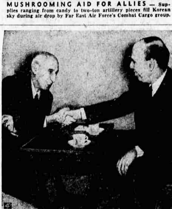
HANDSHAKE OVER TEACUP —Senator Owen Brewster (R-Me) is greeted by Iran's Premier Mohammed Mossadegh at tea time in Tehran during Senator's round-the-world tour.

Excavating HEALTH MASSAGE, exercise, weightlifting, Physiotherapy for reducing relaxation, body building, fitness, for sports. Appointment, phone 3963-5506. Medical Massage, women only. HELP WANTED, FEMALE WANTED, experienced stenographer for general office work. This is a good steady job and requires experience. Write Box 472 Herald and News, stating qualifications. EARN money at home, full part time, Box 471 Herald and News. EXPERIENCED bookkeeper familiar with payroll and general office work. Good steady position. State age and experience in first letter. Write Box 469 Herald and News. HELP WANTED, MALE WANTED elderly lady who needs home to care for children, board, room and some wages. Phone 2-6238. WANTED capable man for ranch work. Small tenant cottage, wood, water lights furnished. Prefer married man. Box 467 Herald and News.