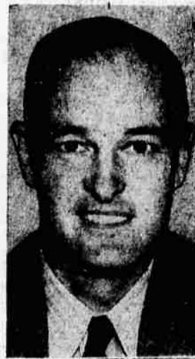
ENVOY TO REDS —George F. Kennan, outstanding Western authority on Russians, is new United States Ambassador to the Soviet Union, replacing Admiral Alan G. Kirk.