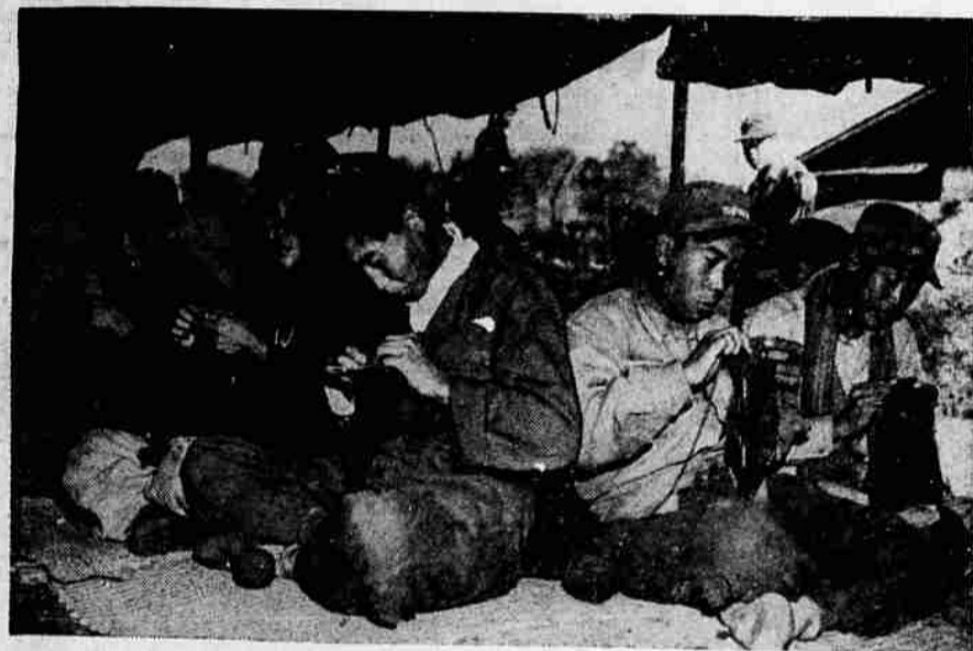
POW'S TURN TO NEEDLE —Communist soldiers in U. N. prisoner-of-war camp on Koje-do Island off Korea busy themselves making socks and gloves for Korean orphans at Pusan.