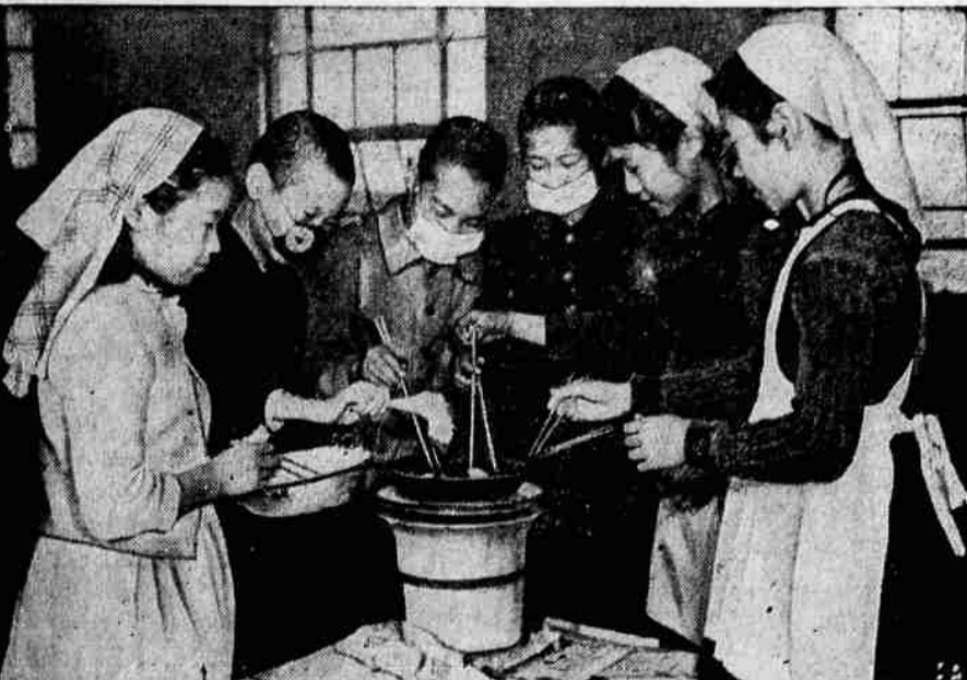
SAMPLING SKILL —Wielding chopsticks, youngsters taste results in cooking class at Tokyo primary school. Cooking is one of new subjects for boys in Japan's post-war education.