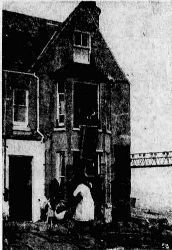
RAGING SEAS CREATE PROBLEMS —Residents salvage possessions from upper story of house at Selsey, England, during hurricane weather which lashed British Isles.