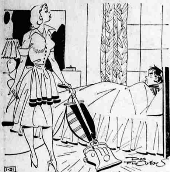
"But I don't WANT to do the living room, dining room, hall or guest room first!"