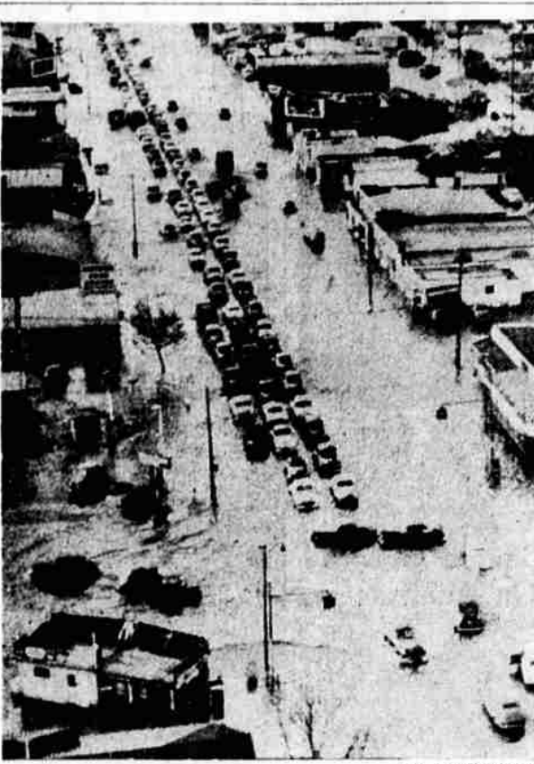
LIQUID SUNSHINE —Motorists find the going slow at this Los Angeles intersection after the Southern California city was drenched with 3 1/2 inches of rain in 24 hours.