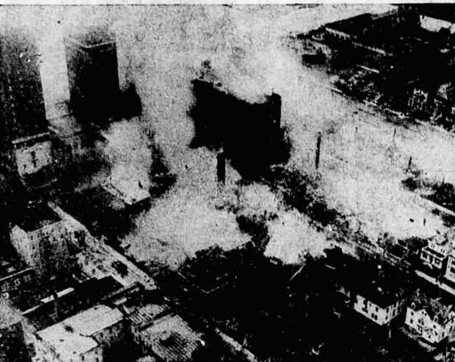
MILLION DOLLAR FIRE RAZES RESORT HOTELS—Whipped by high winds, fire sweeps through three unoccupied Atlantic City, N.J., hotels a block of stores on the famed Boardwalk and a 300-room section of the big St. Charles Hotel (upper left), with a loss estimated by fire officials at "several million dollars." The Boardwalk runs diagonally across top of picture to the Steel Pier at extreme upper right.