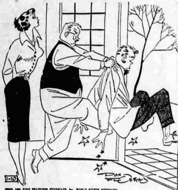
Now he can sue you for enough for us to get married on!"