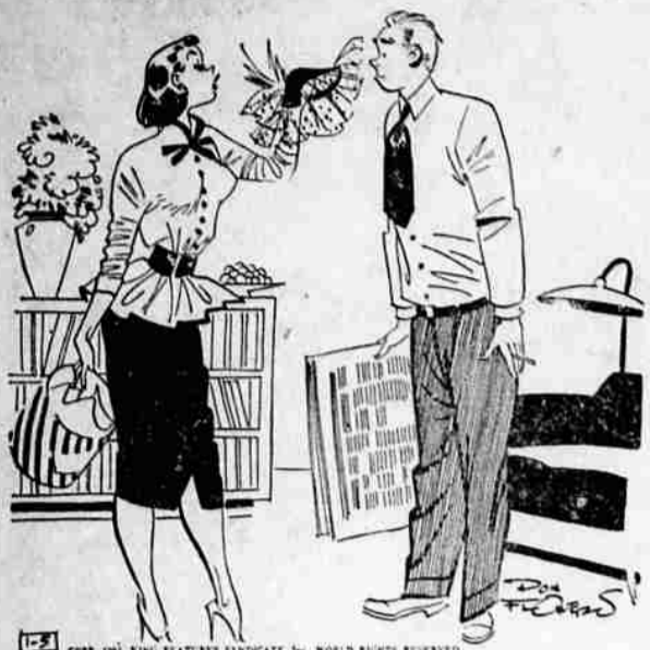
"It's over my budget, but you should have seen the dizzy dame who thought SHE was going to buy it!"