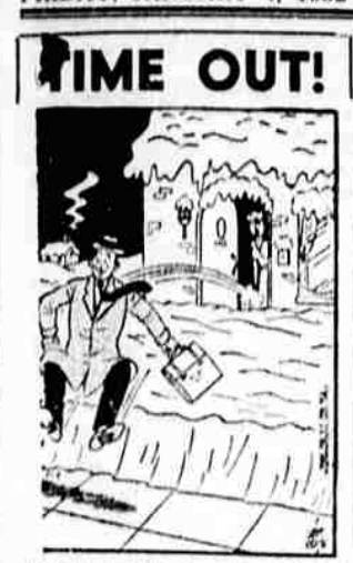
"Well, I wish you'd forget you held the standing broad jump re-cord at college, and buy a snow shove!"