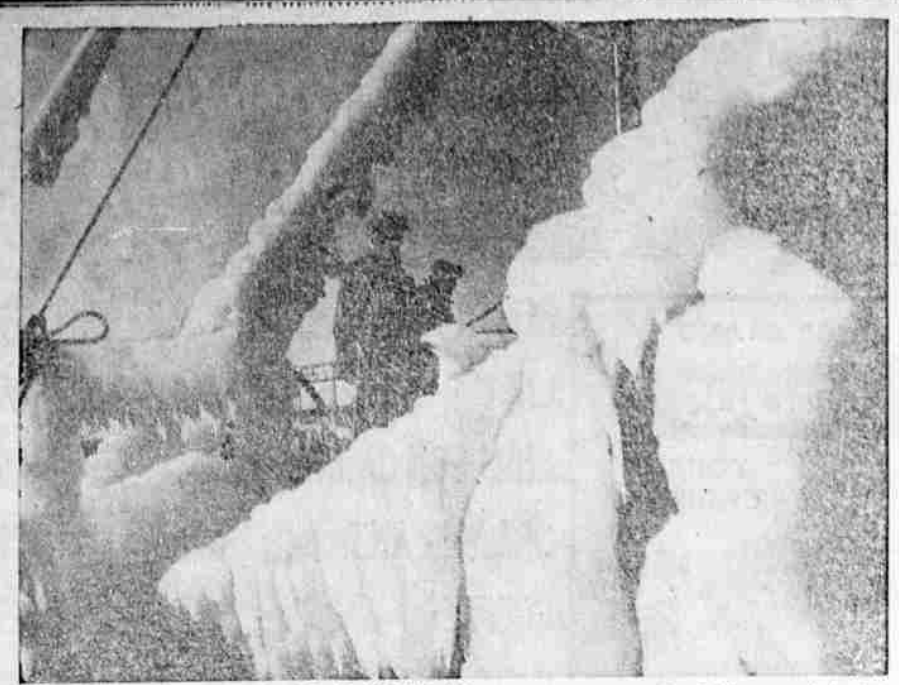
EFRIGERATION NOT NEEDED - The fishing trawler Drift, encased in ice accumulated during Atlantic trip, makes harber at Boston with catch totaling $5.000 pounds.