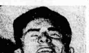
REV. BOB RICHARDS prayer of thanks

ROANOKE, Va. (AP) — The Rev. Robert (Bob) Richards, whose amazing polevaulting and decathlon performances earned him the 1951 James E. Sullivan Memorial Trophy, said Thursday he will defend his championships in all of the indoor meets the next few weeks.