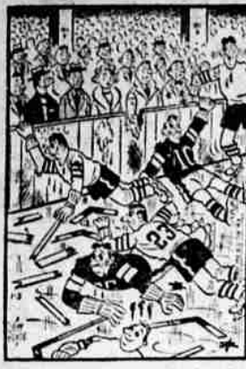
"For a minute there, I thought tempers were going to flare!"