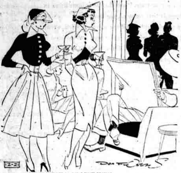
"Never mind him. I understand he's the host."