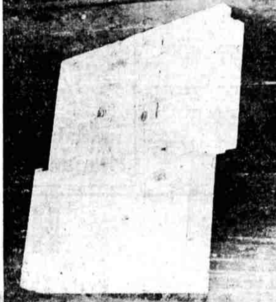
THESE TWO PIECES (not full size) are samples of the work being done at the White Pine Lumber Co. glue-up plant at Lakeview. Wall and floor materials are made from lumber blocks otherwise wasted.

NEW YORK, (AP)—The American Telephone and Telegraph Co. says more than a million persons desiring phone service in 1952 will not get it because of inadequate government copper allocations. The A. T. and T. said yesterday in a statement that its bell system had been allocated copper supplies 25 percent below requirements for the first quarter of 1952 by the national production authority. Fifteen million new telephones have been added in the past six years, the company said, but it still has a waiting list of 800,000. Bell said the list will exceed a million next year if current copper allocations are not increased.