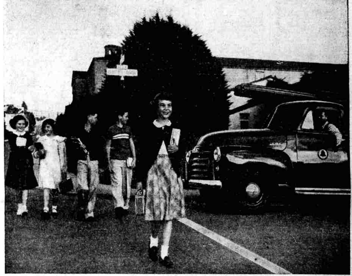
Careful training and observance of safety codes make telephone drivers among the safest on the road today.