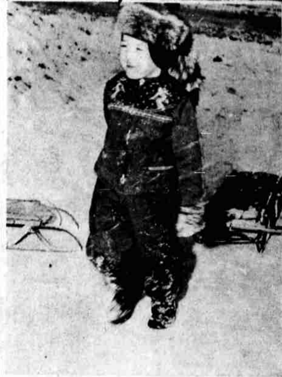
WHEN ENOUGH SNOW falls this winter, the Klamath Falls city recreation department will again put into operation its controlled sliding areas which probably has saved numerous aches and pains and broken bones which are common to sledding accidents. The city's program of roping off certain slopes for sledding only makes it safe for the youngsters, even the size of this little Dan'l Boone photographed last year on Washington street.