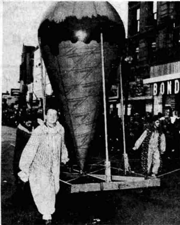
BOY, WHAT A STOMACH ACHE an ice cream cone this size could bring about. It is 13 feet high, and won't melt. It's made of plastics.