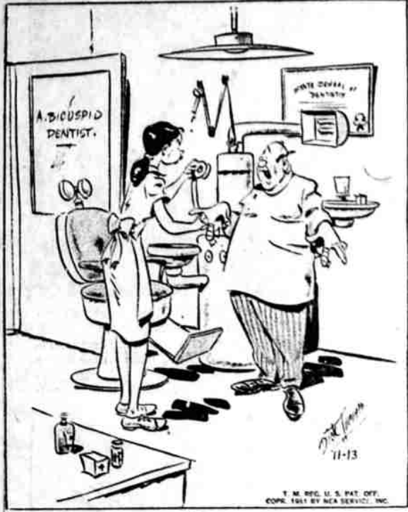
"I gotta quit voicing my political opinions — too many patients get excited and try to answer me back!"

HERALD AND NEWS, KJAMATH FALLS, OREGON Page Eight Tuesday, November 13, 1951