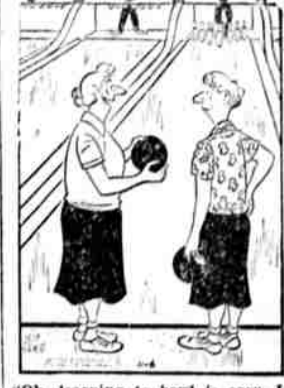
"Oh, learning to play is hard. It's hitting those pins that's hard!"