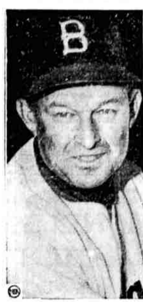
CHUCK DRESSEN ... he'll be back

BROOKLYN, N.Y.—Chuck Dressen, being in elly not so long ago by Dodger fans, will be back as Brooklyn manager in 1952. Dressen, although he hasn't signed a contract, was rehired yesterday for one year at a salary estimated at $30,000. Brooklyn Pres. Walter O'Malley announced the retention of Dressen in a press conference. It came as no surprise. Dodger second baseman Jackie Robinson confirmed rumors that Dressen would be retained last Friday in Los Angeles. Robinson said the players were told Dressen would return. Regarding the terms of the contract O'Malley said, "chances are it will be the kind of contract we are beginning to like—one year. No trial clauses. Just a straight contract. It is his right to be paid, we probably could get together," he continued. "But I do not think he's overpaid."