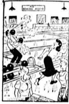
"Now watch him try to use that as an excuse to get acquitted!"