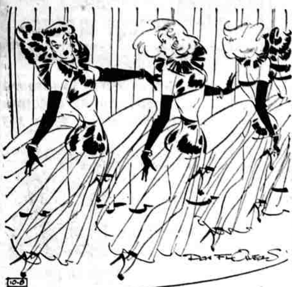
"Isn't that your boy friend in the second row, with the roving eye?"