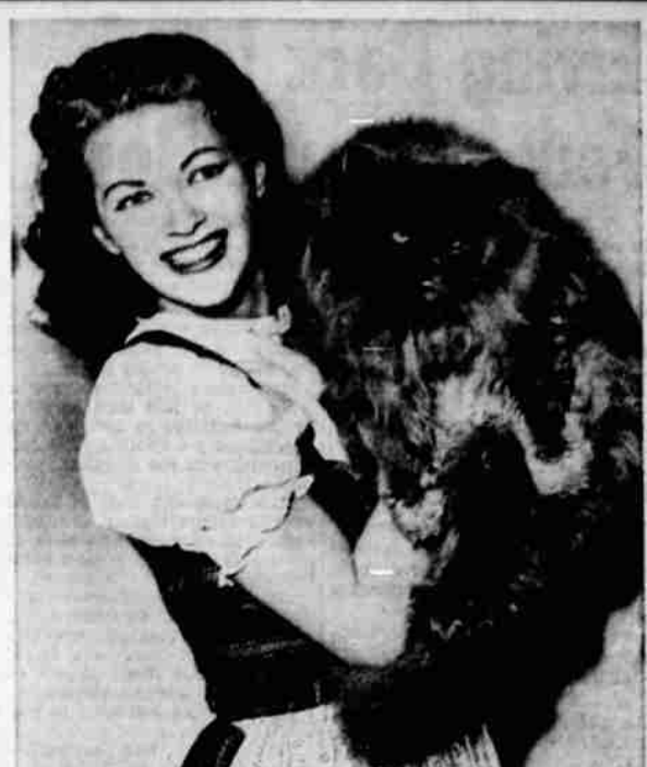
CHAMP "PURRSIAN" —Screen star Yvonne De Carlo holds the Blue Persian, "Champion Masterpiece," who is getting set to defend his title in the Hollywood cat show. With Yvonne on his side, the champ looks plenty confident.