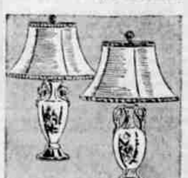
Table Lamp Value Rayon Shade 6.49 Rich floral decorated China lamp with metal base. Complete with rayon shade . . . a remarkable value at this low price. 23 inches high.

Give your room smart levelness with Sears 6-way floor lamp. Bronze plated graceful metal column. Heavy weight base. Complete with reflector and 19" plastic shade, with braid trim on top and bottom.