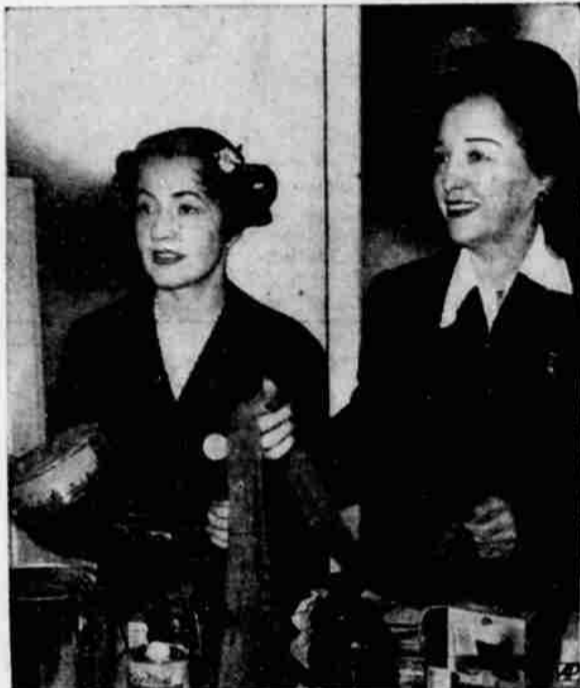
BAZAAR WORKERS—Mrs. Douglas Fairbanks (left) and Bebe Daniels sell goods at a teen-age stall of the London Christmas bazaar for the National Girls' and Mixed Clubs fund.

barley 4; flour 5; corn 7, oats 3; millfeed 6.