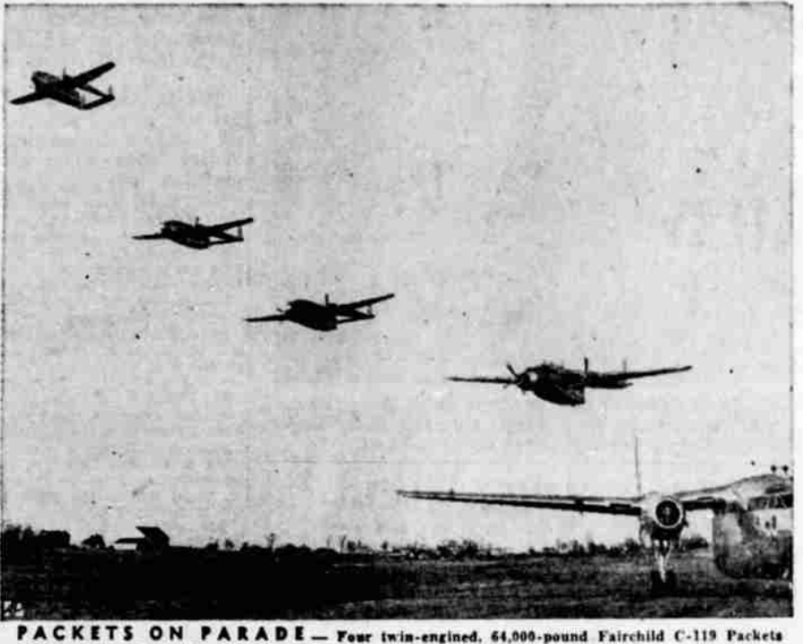
PACKETS ON PARADE—Four twin-engined, 64,000-pound Fairchild C-119 Packets fly over the plant at Hagerstown, Md., before moving to Air Force bases for cargo-transport use.