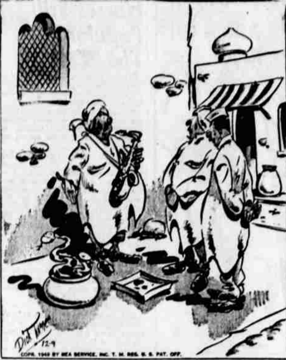
"Ever since that touring American vaudeville unit hit here, they go for nothing but be-bop!"